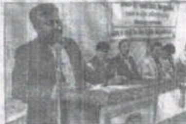
सुकन्या योजना के बारे में जानकारी देने के लिए शिविर का आयोजन किया गया।

सुकन्या योजना की जानकारी देने के लिए शिविर का आयोजन किया गया। इस दौरान सुकन्या योजना के बारे में जानकारी दी गई।