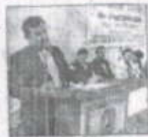
शिविर में ग्रामीणों को कानून-कर्तव्य के बारे में जानकारी देने के लिए शिविर का आयोजन किया गया।

ग्रामीणों को कानून-कर्तव्य के बारे में जानकारी देने के लिए शिविर का आयोजन किया गया।