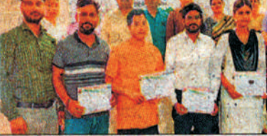
शिकारपुर के लॉ कॉलेज में संगोष्ठी और निबंध प्रतियोगिता में शामिल छात्र।