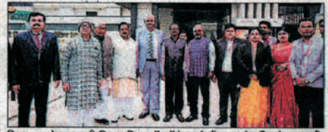
शिकारपुर के सरस्वती विद्या मंदिर लॉ कॉलेज को बी प्लस ग्रेड मिलने पर खुशी मनाते हुए।