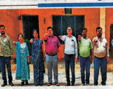
शिकारपुर के लॉ कॉलेज में हिन्दी दिवस पर निबंध प्रतियोगिता